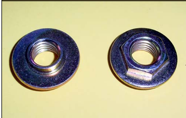
TR9943 5/8-11 Stone Clamp

Designed to be used on any thin wheel application