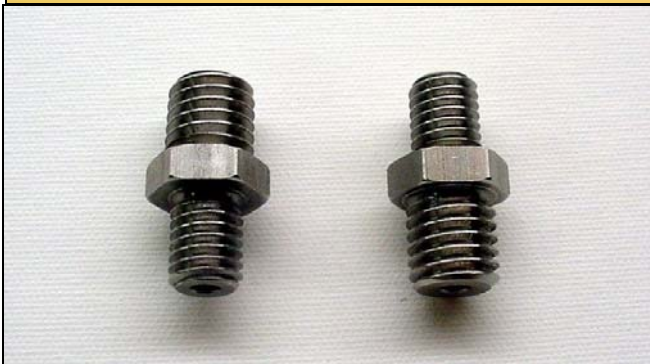
TR9944 1/2-13 to 5/8-11 S/S Coupler